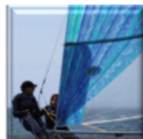
Injection in action

Injection is the latest innovation from DIMENSION-POLYANT – never seen in the sailcloth market before! Inspired from the windsurf market where colors and pleasing looks of the sails have long been an important factor for selling sails, DIMENSION-POLYANT, Inc. has developed a process where many colors can be incorporated into a visually pleasing yet totally random color pattern.